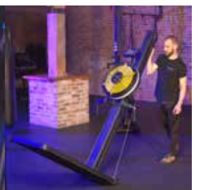
Integrated moving wheels for easy transportation

FITNESSTRADING PREMIUM QUALITY - EXCELLENT SERVICE