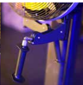
Stainless Steel quick exchangeable mechanism for handles