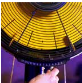
Manual adjustable magnetic resistance system