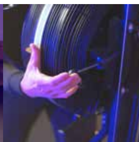
Lever to place main unit in desired position